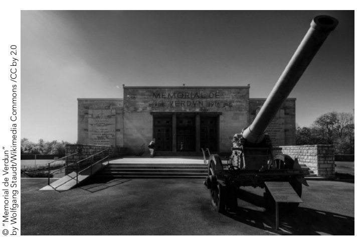
(Institute for Dark Tourism Research 2012).

Despite being the subject of much academic research and debate as to the exact nature of Dark tourism, it is yet to have been picked up by the tourism industry as a niche market perhaps due to an inability to "pin it down" (Werdler 2010). Therefore, attempting to engage with the Dark tourist as a potential target user for the Proposed Service could throw up a range of definitional and conceptual challenges. Instead, given the increasing importance to tourism of sites of memory/battlefields etc, it may be better to focus on people who have an interest in military history or World War One as the special interest behind visiting these sites rather than the Dark tourist.