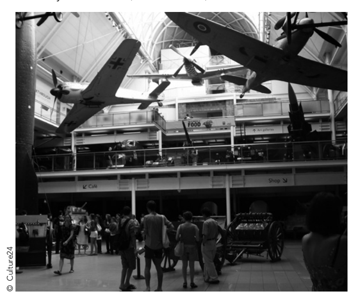
5.4.4 Rise of city breaks

Whilst many commentators argue that tourists are becoming more omnivorous in their cultural consumption patterns (Richards 2003), heritage still retains a dominant role within the consumption patterns of cultural tourists. The most recent ATLAS survey showed that in terms of the types of cultural sites and attractions visited, museums, historic sites and monuments were the most important. Cultural events, such as concerts and dance performances, were in contrast visited by relatively few tourists (Richards 2007).