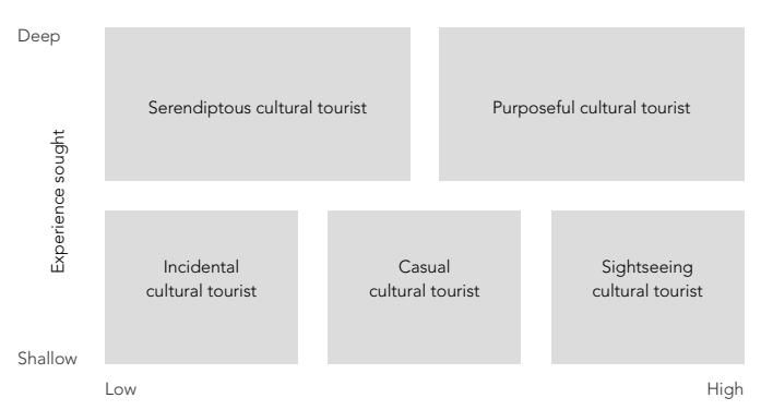
Importance of cultural tourism in the decision to visit destination

The 'McKercher and Du Cros types' provide a good way to analyse these outcomes by comparing motivation against experience.